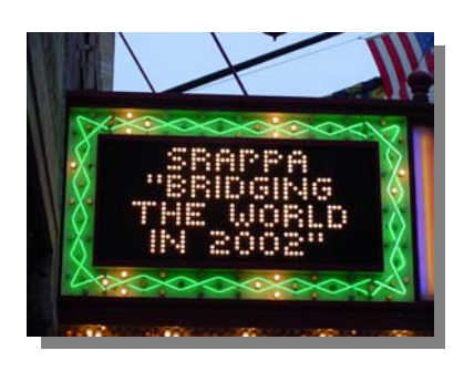
Marquis at the Fabulous Fox theater displaying SRAPPA theme for 2002, " Bridging the The World In 202"