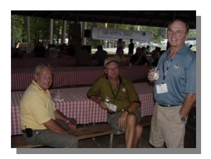
SRAPPA Day Bar-B-Que at Stone Mountain Park

For Emory's staff perhaps the highlight of the conference was the opportunity to meet many of the people we had talked with during conference planning. Of course, the networking opportunities for all of us were endless. What an excellent opportunity to share our experiences and knowledge! We feel that we made inroads toward "Bridging The World In 2002". Hopefully we helped all of you bridge some gaps to achieve