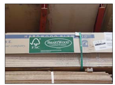
(Continued on page 11)

Developing a LEED building is a very commendable goal. Any higher first costs are more than