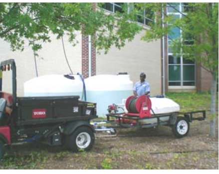
flower beds on