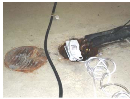
A condensate pump pumps the water from floor drain to tanks 6 floors below.