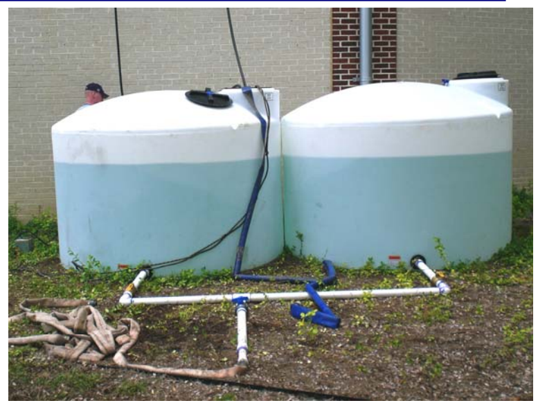
Two 1500 Gallon tanks recover the condensate return from 3 Air Handling Units and have it available for Landscape crew to water flower beds and shrubs.