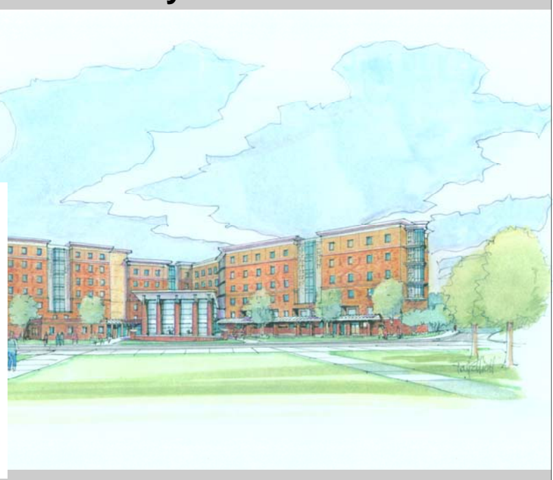
Rendering of West Campus Residence Hall & dining Hall.