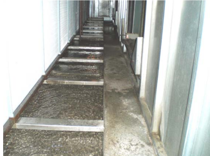
Condensate pan of a 20 Tons Air Handling Unit