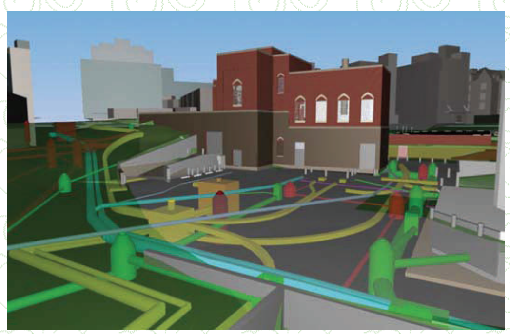
A close-up 3D rendering shows the complex pipe network surrounding the Duke University West Campus Steam Plant.

The model was used throughout the entire design process to