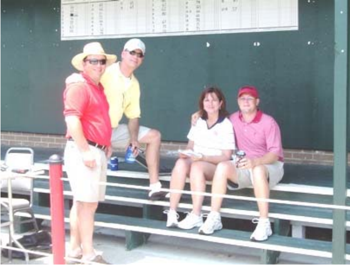
Golf Tournament Volunteers from West Georgia.