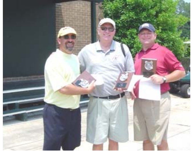
First Place winners of the Golf Tournament