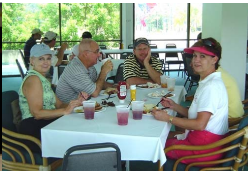
Lunch after Golf.