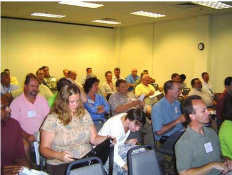
Attendees at an educational session.