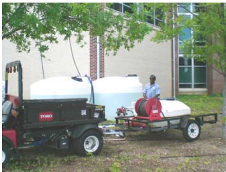
A trailer transports the water to various flower beds on