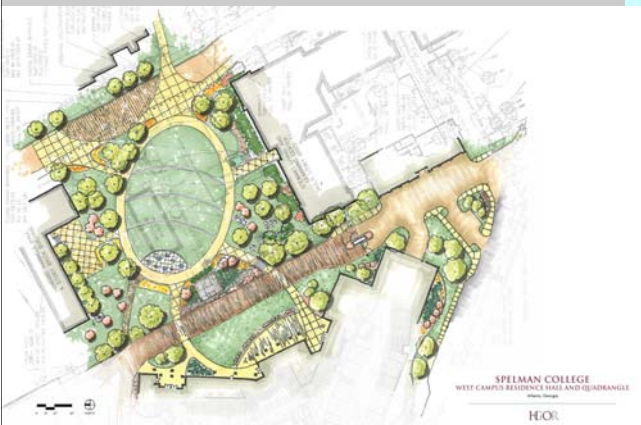
Rendering of West Campus Landscape.

Spelman College broke ground in October 2006 to build a new 300-plus bed "green" residence and dining hall -- the first new construction of the 21st century at the college. It also recently updated the campus' utility infrastructure and finished renovating Rockefeller Hall, which was built in 1886.