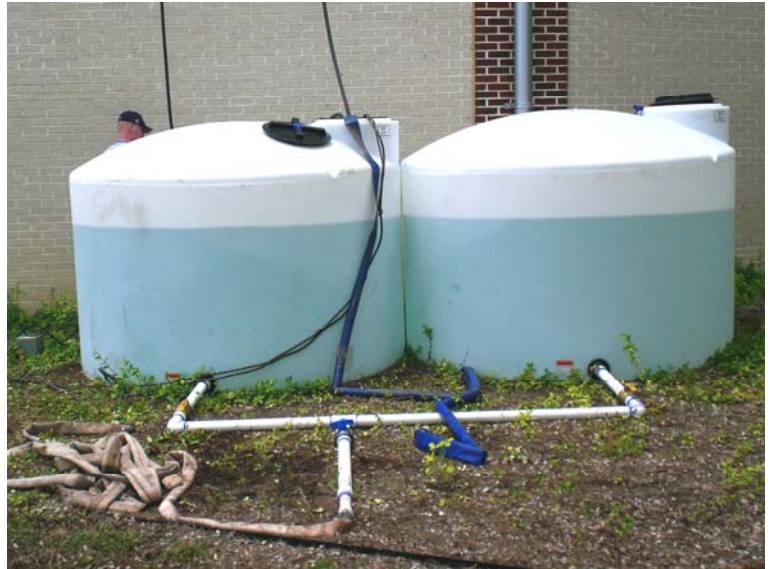
Two 1500 Gallon tanks recover the condensate return from 3 Air Handling Units and have it available for Landscape crew to water flower beds and shrubs.

Tech new Material Science and Engineering building, Engineering and Science Technology building as well as the Klause computing center are also designed to recover rain and condensation water. The water is collected into a large underground tank and pumped out to irrigate the lawns.