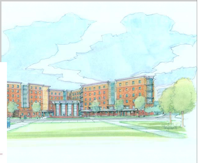
Rendering of West Campus Residence Hall & dining Hall.