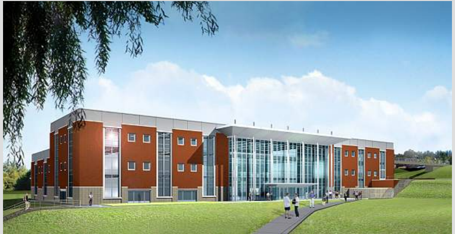
Rendering of our Library Technology Center under construction