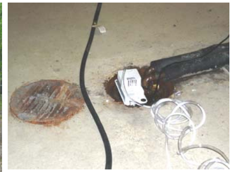
A condensate pump pumps the water from floor drain to tanks 6 floors below.