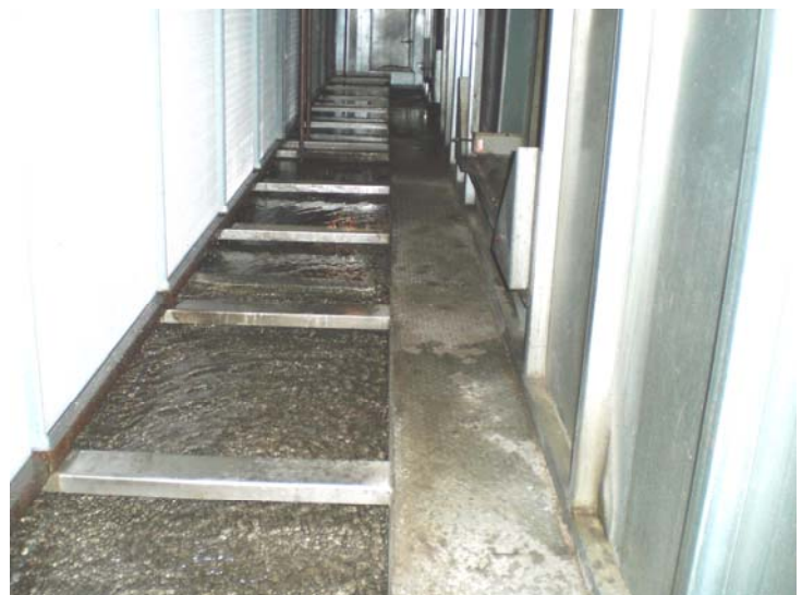
Condensate pan of a 20 Tons Air Handling Unit