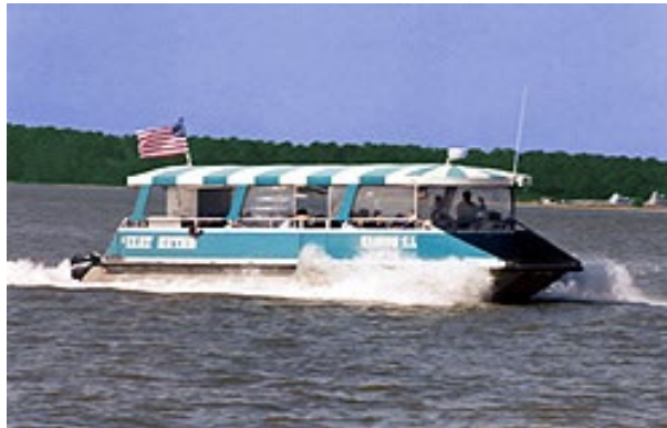
Departs from the Jekyll Wharf

Lunch Included: 12:00 p.m. at the Jekyll Island Convention Center