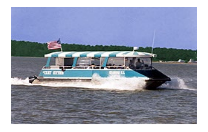
Departs from the Jekyll Wharf

Lunch Included: 12:00 PM at the Jekyll Island Convention Center